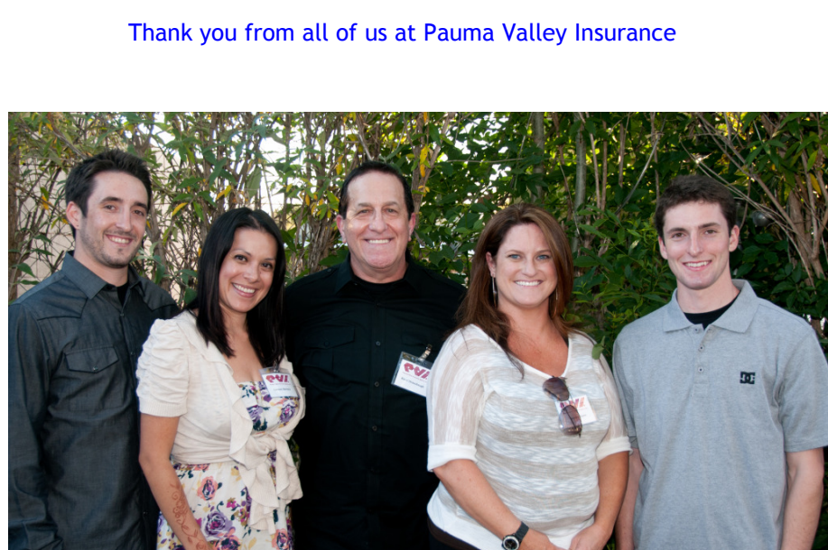
PVI Staff Members

Thank you from all of us at Pauma Valley Insurance