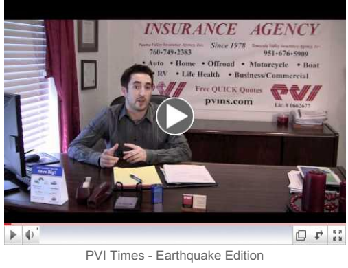
PVI Times - Earthquake Edition